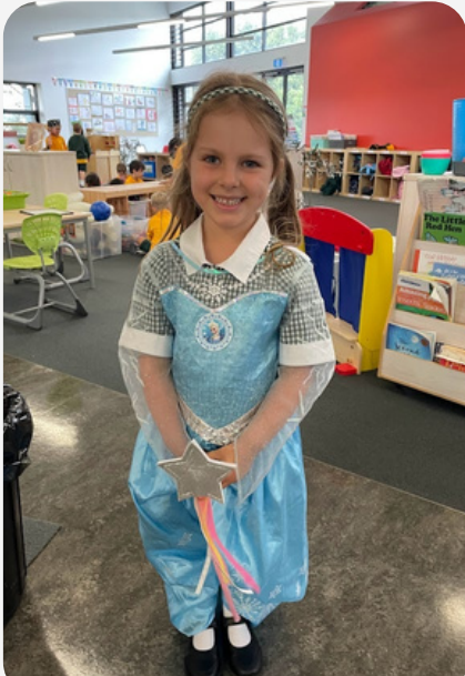
PREP STUDENTS ENJOYING THEIR FIRST DAYS OF SCHOOL!