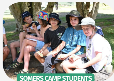
SOMERS CAMP STUDENTS