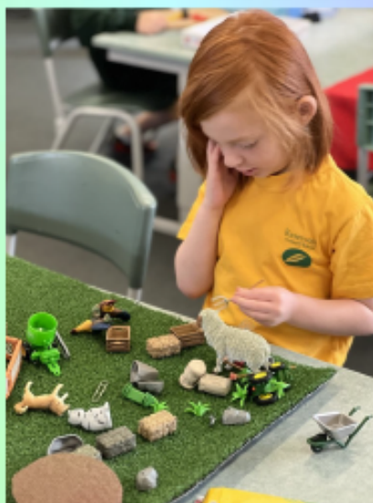
Creating a farm.