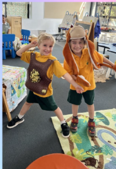
Dress-ups are always fun!