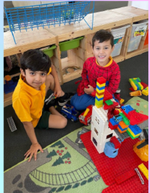
Spiderman giving some engineering advice.

We are excited to ask students what experiences they would like to have set up in Investigations for Term Two!