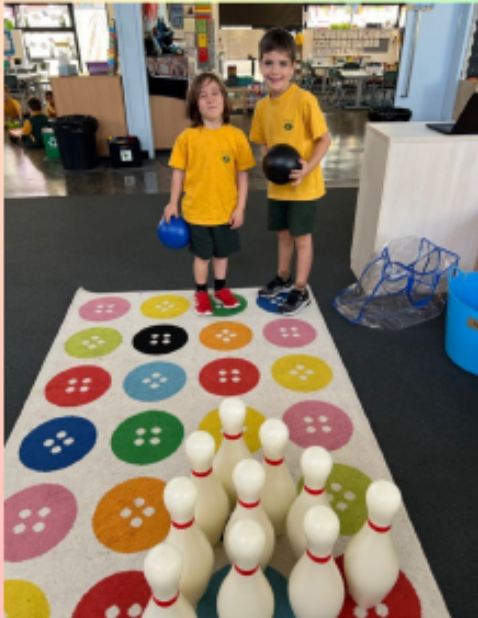
Ready, set, go!