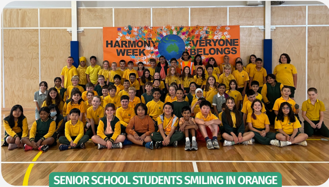
SENIOR SCHOOL STUDENTS SMILING IN ORANGE

At Reservoir we reflect this diversity and proudly celebrate our amazing cultural mix and the unique learning opportunities it creates.