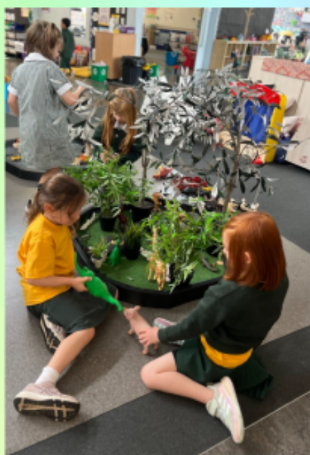
Dinosaurs come to visit the farm!