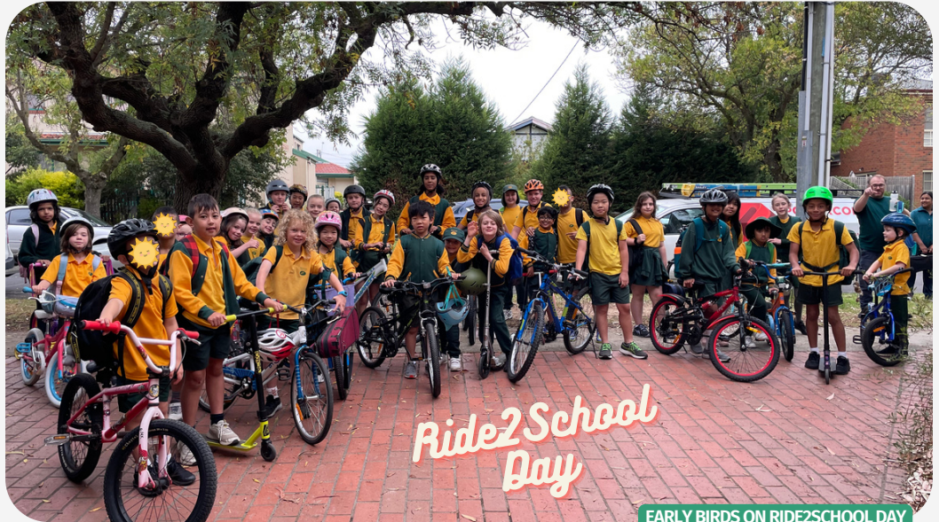
EARLY BIRDS ON RIDE2SCHOOL DAY