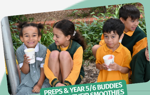
PREPS & YEAR 5/6 BUDDIES ENJOYING THEIR SMOOTHIES

Well done to all students who travelled to school by riding, walking, scooting or skating!