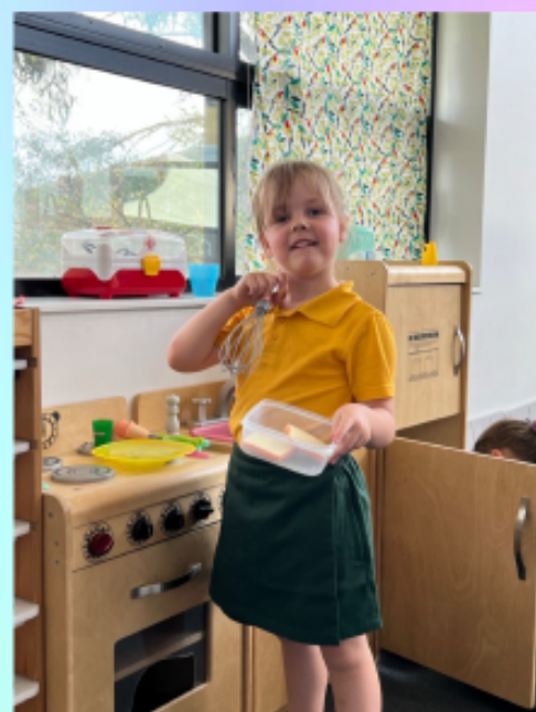
Busy with cooking!