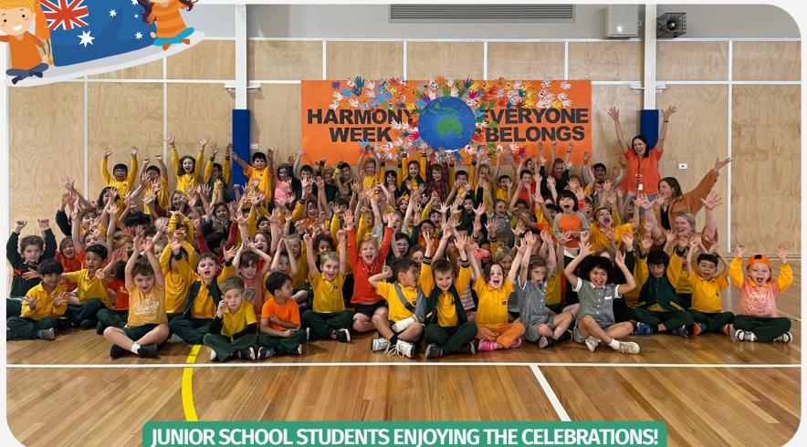
JUNIOR SCHOOL STUDENTS ENJOYING THE CELEBRATIONS!

Orange is the colour chosen to represent Harmony Week. Traditionally, orange signifies social communication and meaningful conversations. It also relates to the freedom of ideas and encouragement of mutual respect.