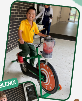
BIKE N' BLEND!