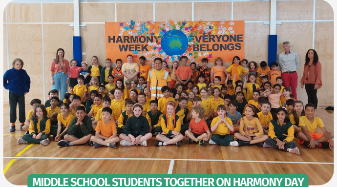
MIDDLE SCHOOL STUDENTS TOGETHER ON HARMONY DAY

Harmony Week is a major celebration because it is all about inclusiveness, respect and belonging for all Australians; from the Traditional Owners of the land to the most recent arrivals.