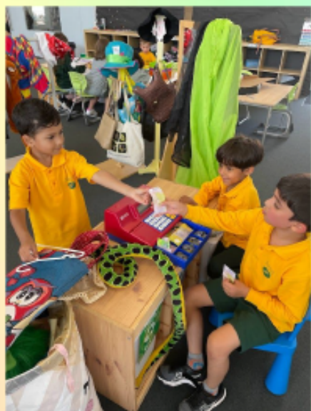
Exploring the use of money at the Op Shop!

Investigations is our play based learning space. Our prep students engage in a range of experiences that promote imaginative role-play, creativity, teamwork, fine motor development and getting along skills. Here are some of their favourite ways to enjoy Investigations!