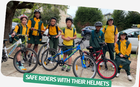
SAFE RIDERS WITH THEIR HELMETS