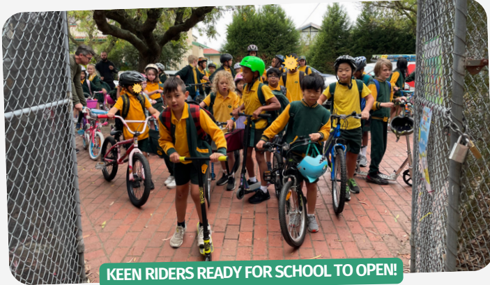
KEEN RIDERS READY FOR SCHOOL TO OPEN!

Students had lots of fun participating in National Ride2School Day by walking, riding or scooting to school and later making their own pedal-powered fruit smoothies!