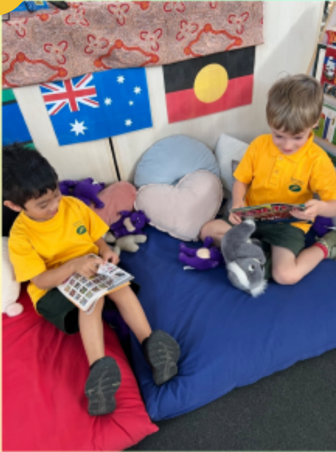
Enjoying a story!