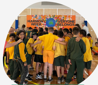
IN THE SPIRIT OF HARMONY DAY

On Harmony Day, Tuesday 21st March, students came to school dressed in orange and contributed to a whole school project with each student tracing their hand, writing their name and drawing images that represent their cultural background (such as flags, food, words etc.) to be included in our Harmony Day banner!