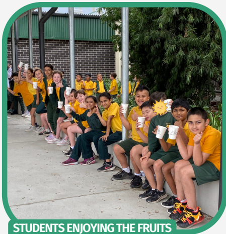
STUDENTS ENJOYING THE FRUITS OF THEIR LABOUR :)