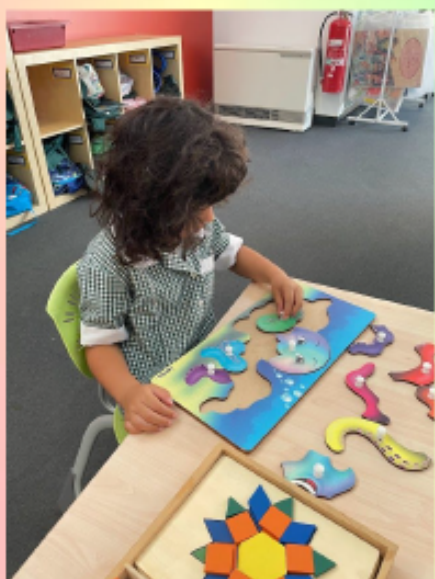
Persisting with tricky puzzles!