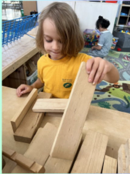
Building in progress!