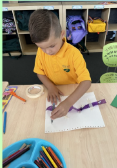
Art and craft is relaxing!